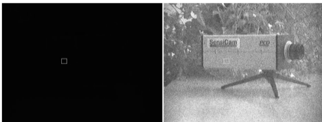
Figure 1 Left image: scaled to full scale 0 - 4095 => 0 - 255 Right image: scaled to minimum - maximum 53 - 75 => 0 - 255 exposure time = 1ms, the white rectangle shows the position and size of the area, which was used to calculate the values for the graph in figure 5.

The following series of images were taken with a 12 bit camera system using exposure times of 1ms, 10ms, 100ms and 500ms. The left images illustrate individual images scaled to maximum (gray levels of 0-255 correspond to 0-4095 counts). The images below show each image individually scaled to minimum-maximum