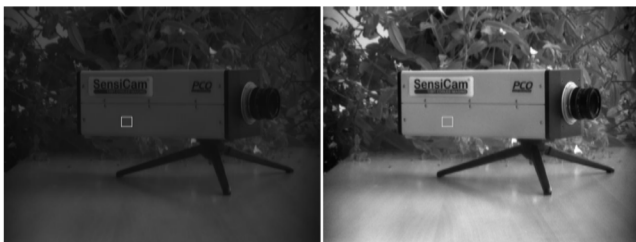
Figure 3 Left image: scaled to full scale 0 - 4095 => 0 - 255 Right image: scaled to minimum - maximum 167 - 1400 => 0 - 255 exposure time = 100 ms (for white rectangle see legend figure1)