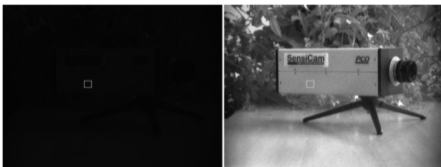
Figure 2 Left image: scaled to full scale 0 - 4095 => 0 - 255 Right image: scaled to minimum - maximum 62 - 190 => 0 - 255 exposure time = 10 ms (for white rectangle see legend figure1)