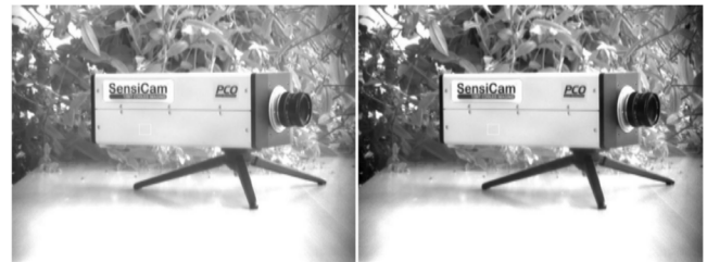
Figure 4 Left image: scaled to full scale 0 - 4095 => 0 - 255 Right image: scaled to minimum - maximum 604 - 4095 => 0 - 255 exposure time = 500 ms (for white rectangle see legend figure1)

level (gray levels of 0-255 correspond to full-scale ranges).