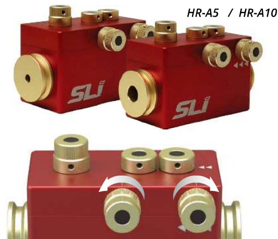
Simple yet precise manual operation